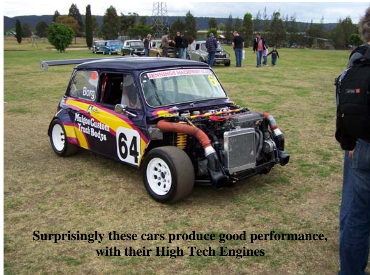
Surprisingly these cars produce good performance, with their High Tech Engines