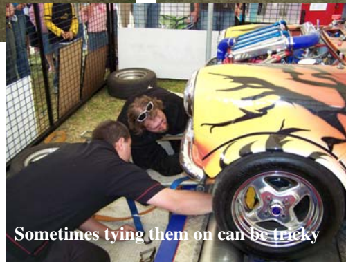
Sometimes tying them on can be tricky