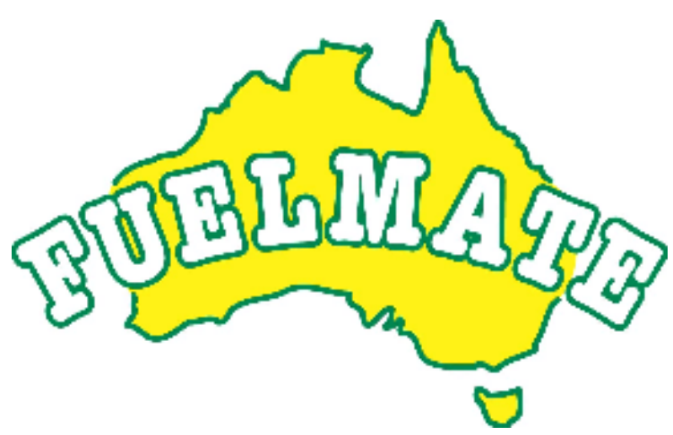
Economy improvements of between 15-20% Better Power and Torque Cleaner engines